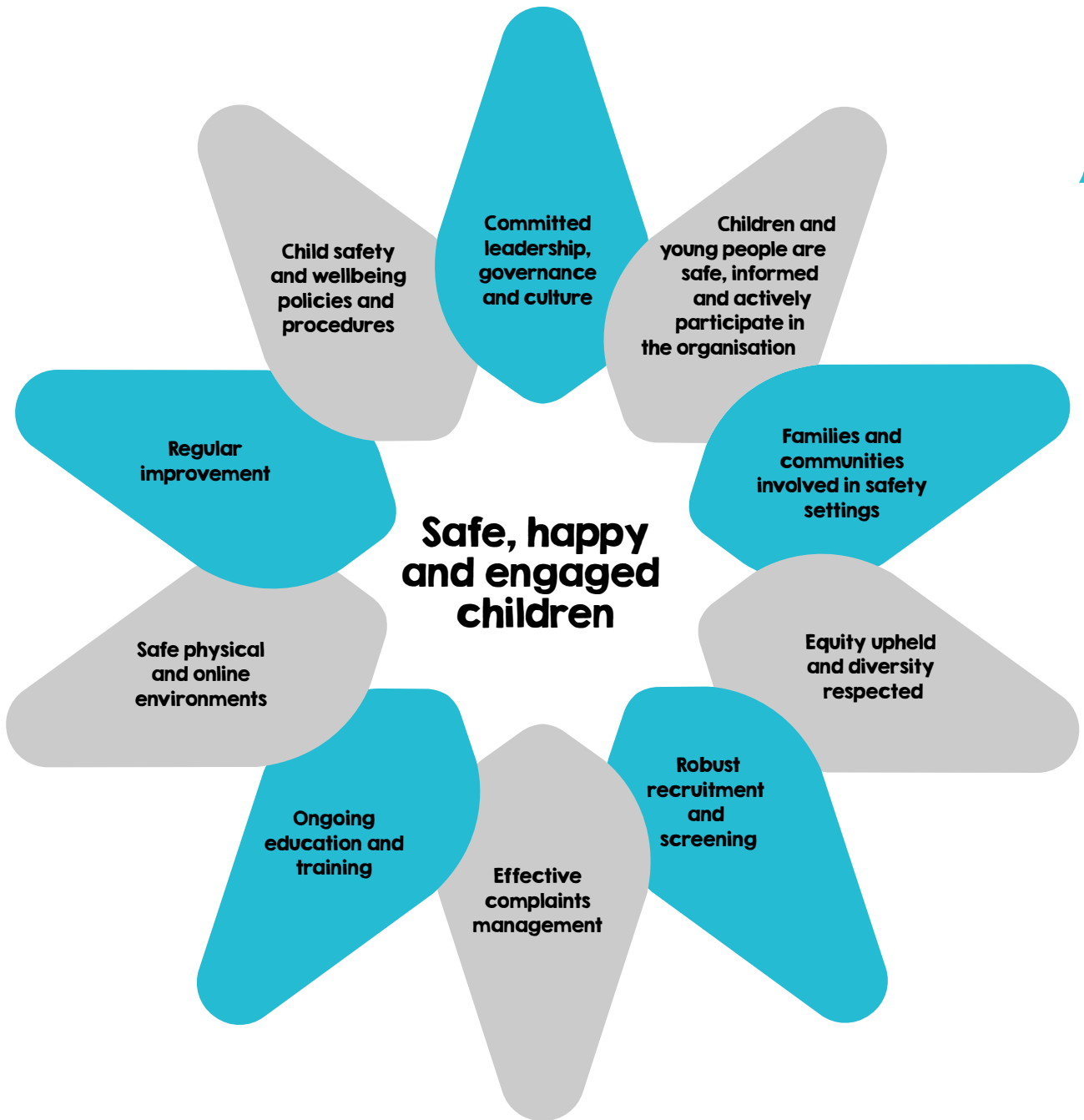
Wheel of Child Safety